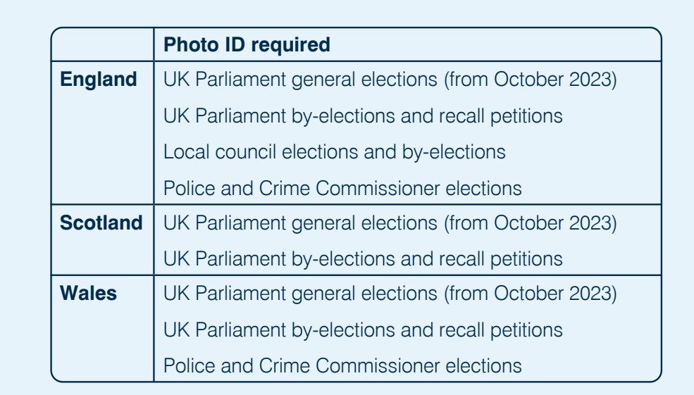
Photo ID is not required in Scottish Parliament and Senedd elections. or local elections and by-elections in Scotland and Wales.

A wide range of photo ID will be accepted, including passports, driving licences and cards with a PASS mark. The name on your ID should be the same name you used to register to vote. If you don't have an accepted form of ID, you can apply for a free voter ID document known as a Voter Authority Certificate.